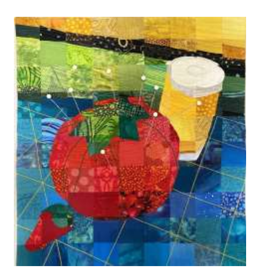
Material Matrix sample